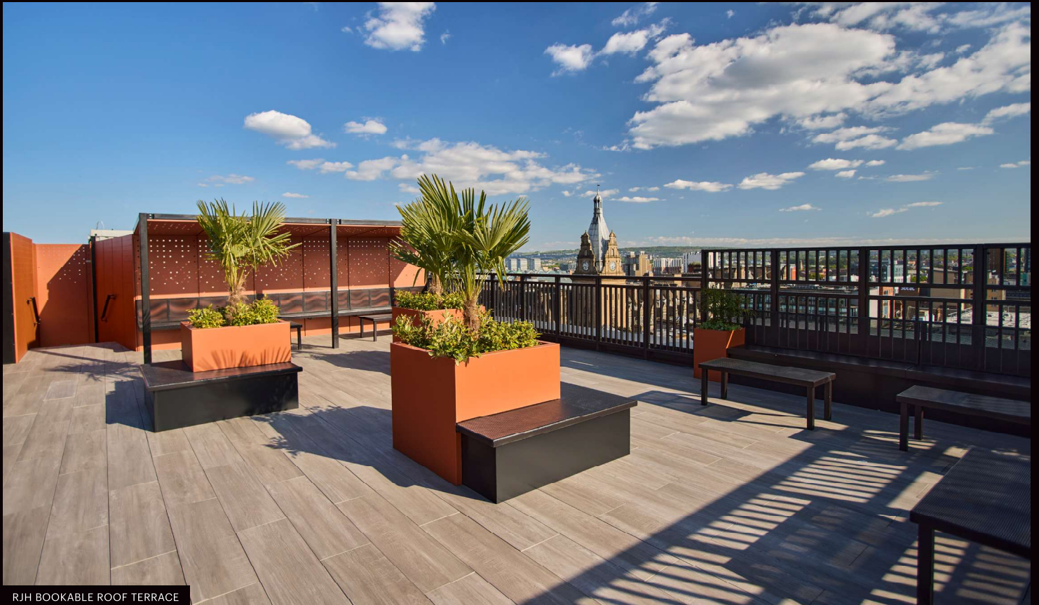
RJH BOOKABLE ROOF TERRACE