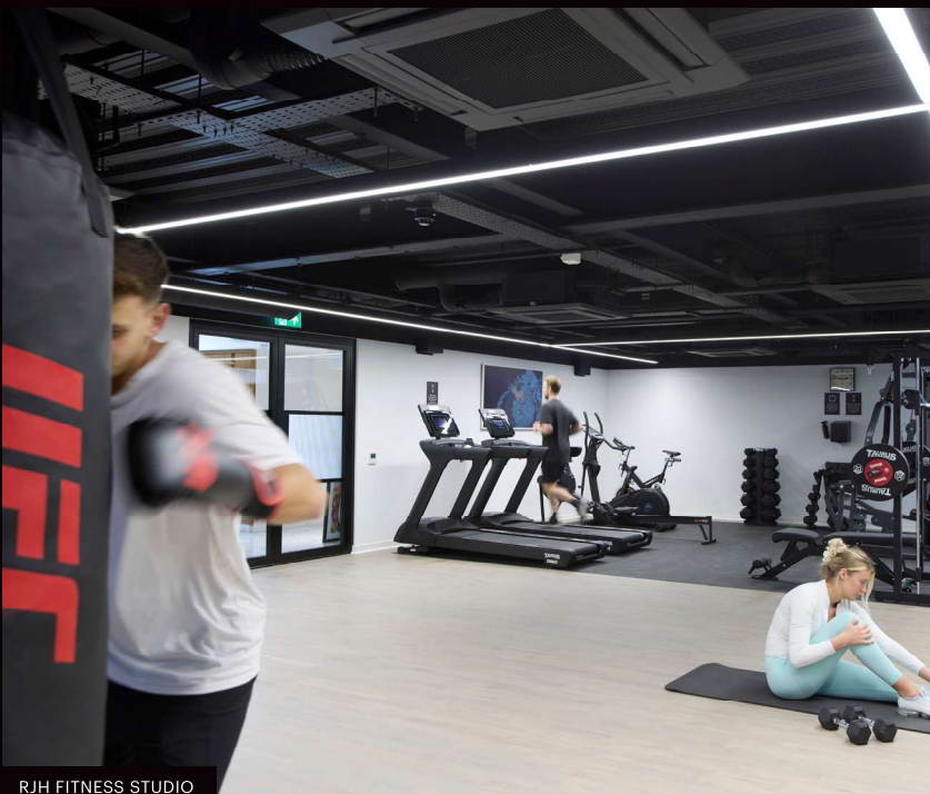
RJH FITNESS STUDIO