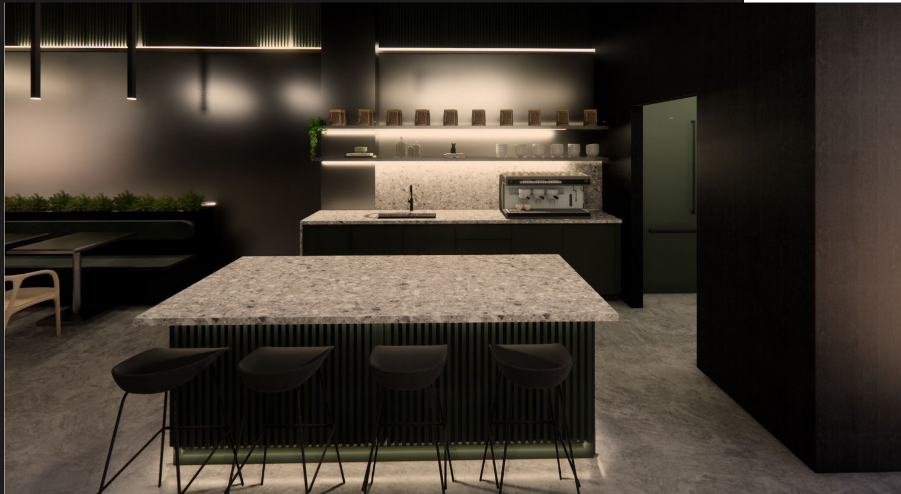
NEW KITCHEN/ CAFETERIA