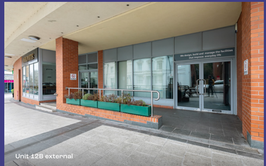
Unit 12B external