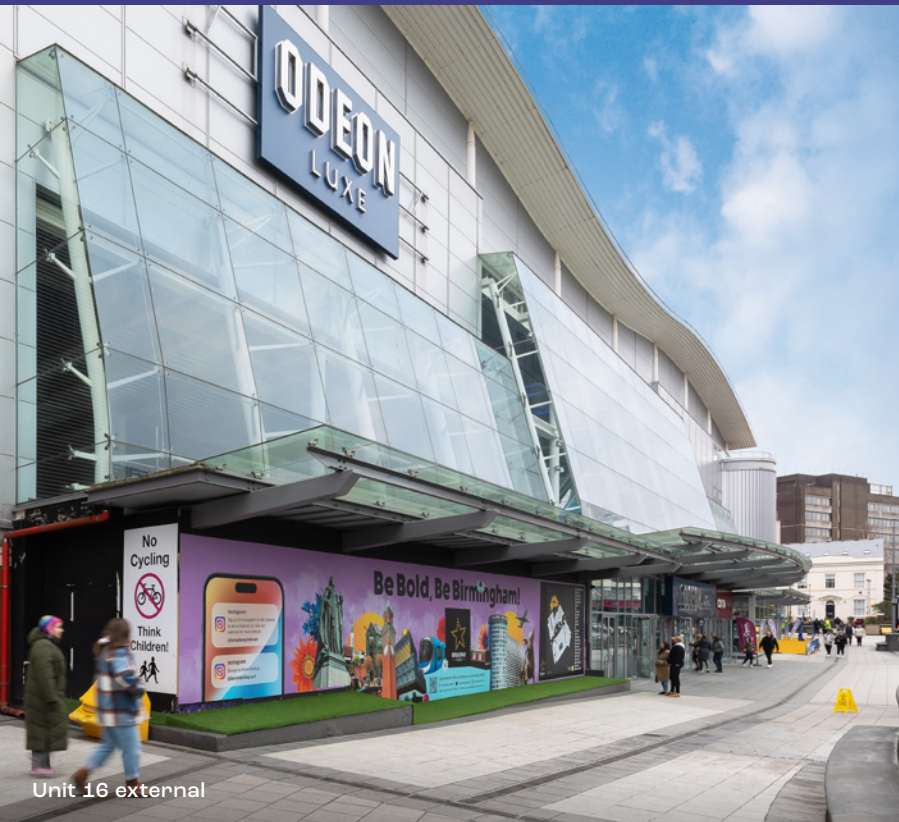
Unit 16 external

BIRMINGHAM IS ONE OF THE YOUNGEST CITIES IN EUROPE WITH 40% OF THE POPULATION UNDER THE AGE OF 25