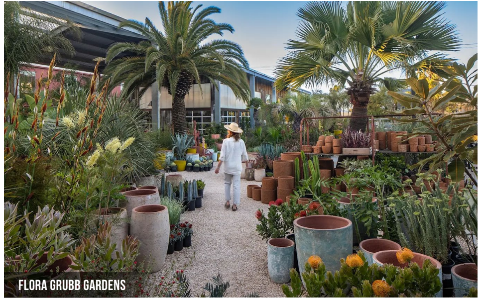
FLORA GRUBB GARDENS