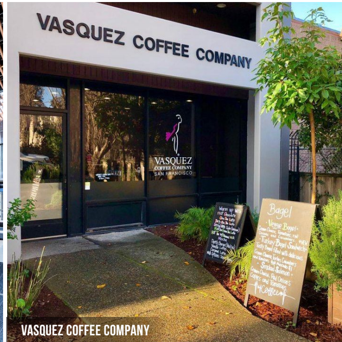
VASQUEZ COFFEE COMPANY