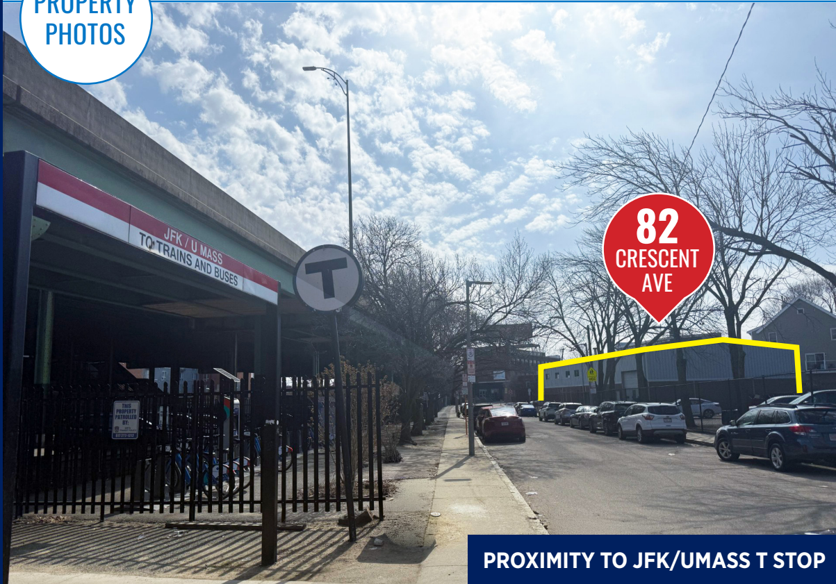
PROXIMITY TO JFK/UMASS T STOP