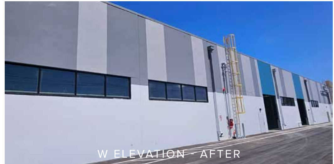
W ELEVATION - AFTER