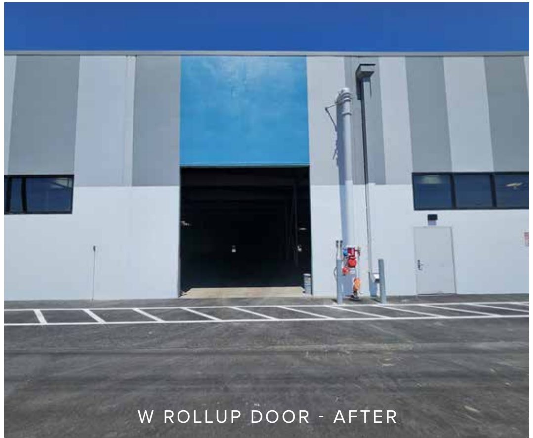
W ROLLUP DOOR - AFTER