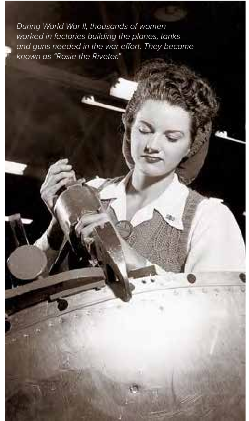
During World War II, thousands of women worked in factories building the planes, tanks and guns needed in the war effort. They became known as "Rosie the Riveter."