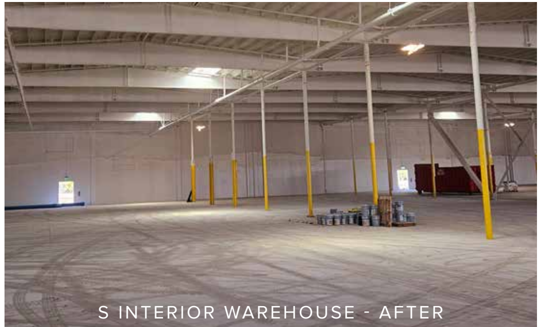
S INTERIOR WAREHOUSE - AFTER