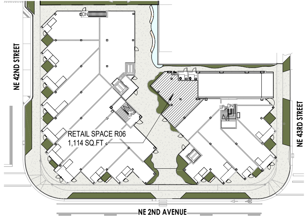
1 KEY PLAN SCALE: 1" = 50'-0"