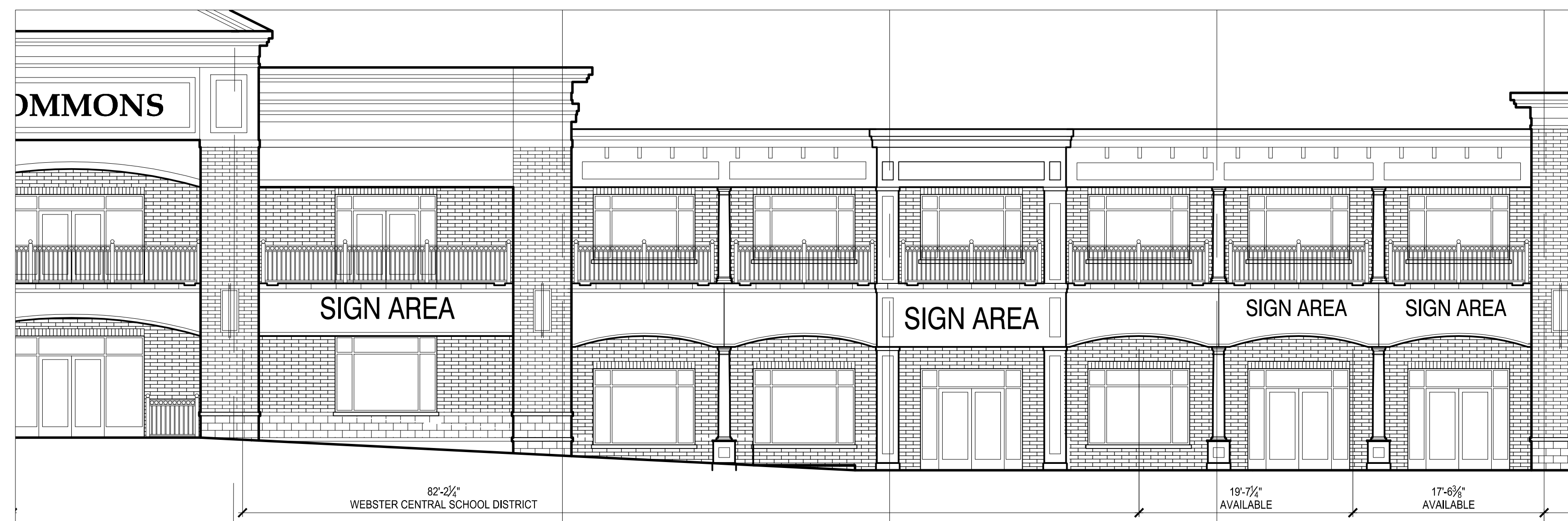
PARTIAL ELEVATION \frac{1}{8}''=1'-0''