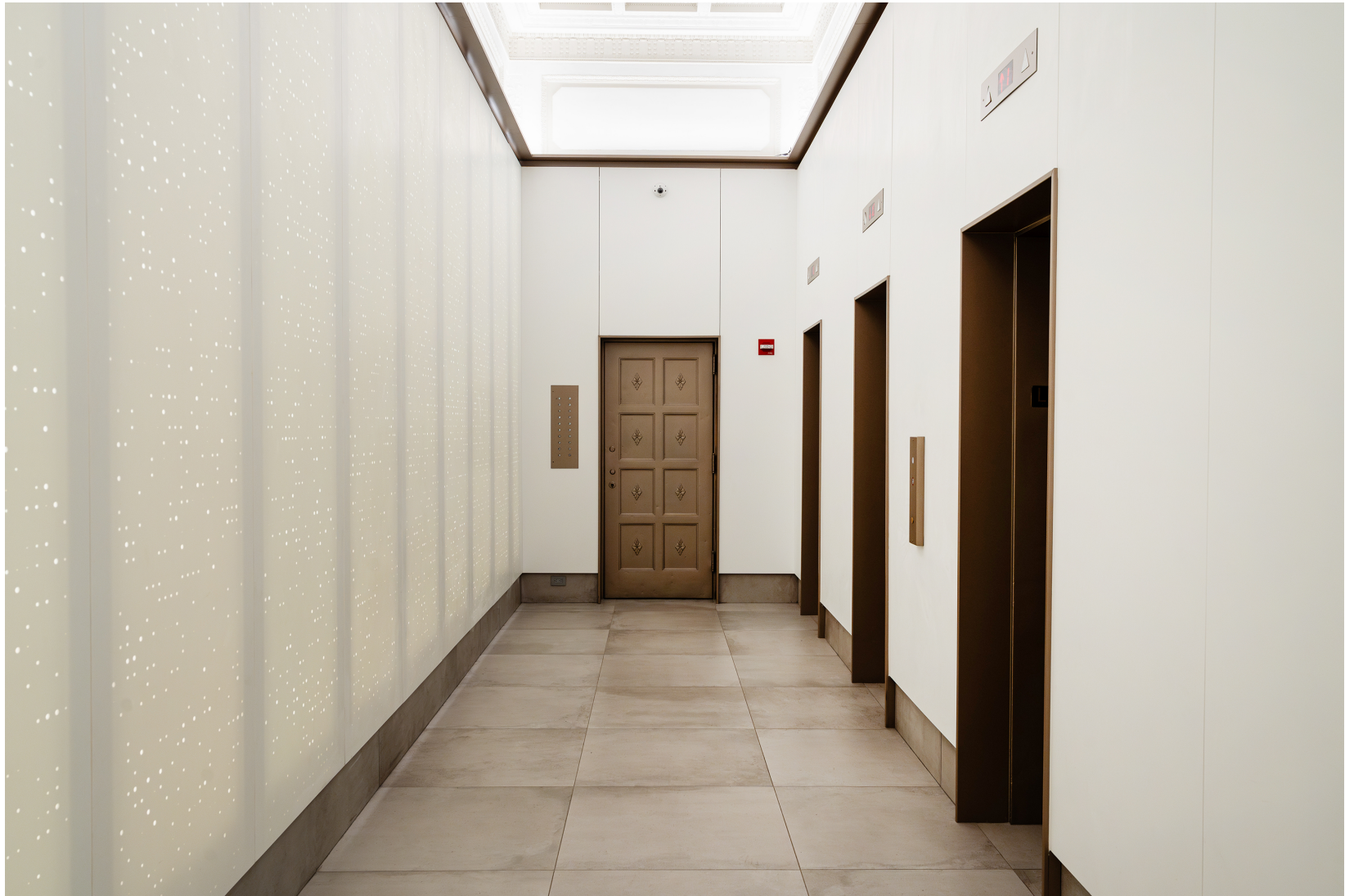
Brand new renovated lobby Upgraded elevators (3 passenger, 2 freight) 24/7 attended lobby