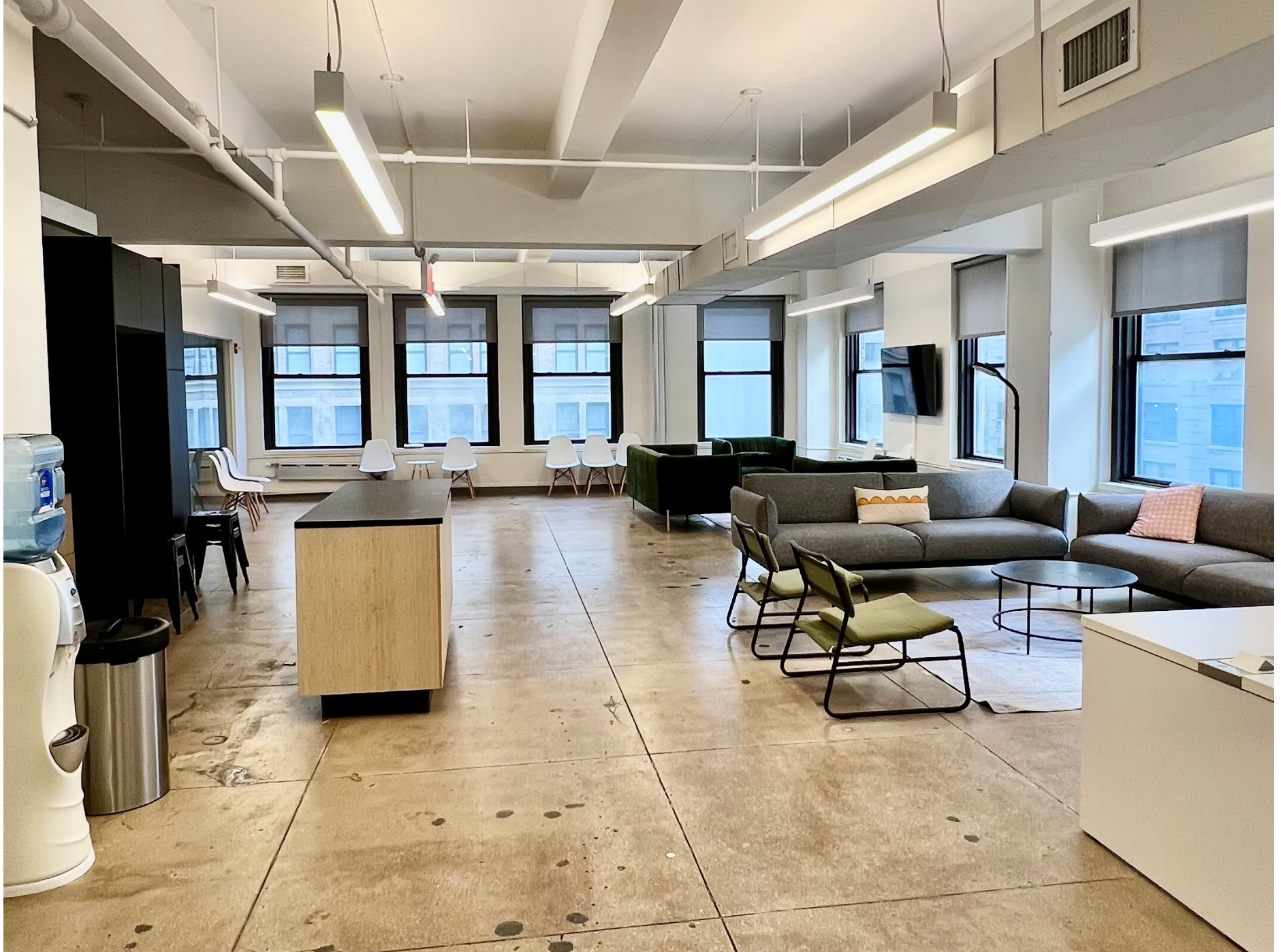
350 7th Avenue, Suite 600 3,700 rentable sq. ft.