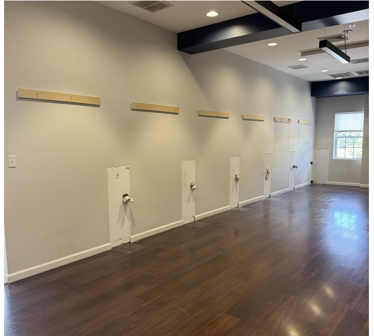
13380 | Former Salon