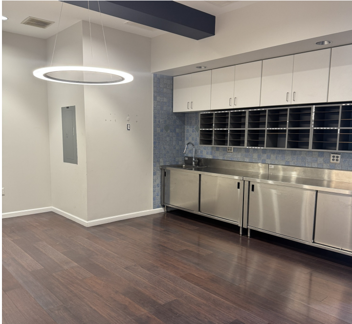
13380 | Former Salon