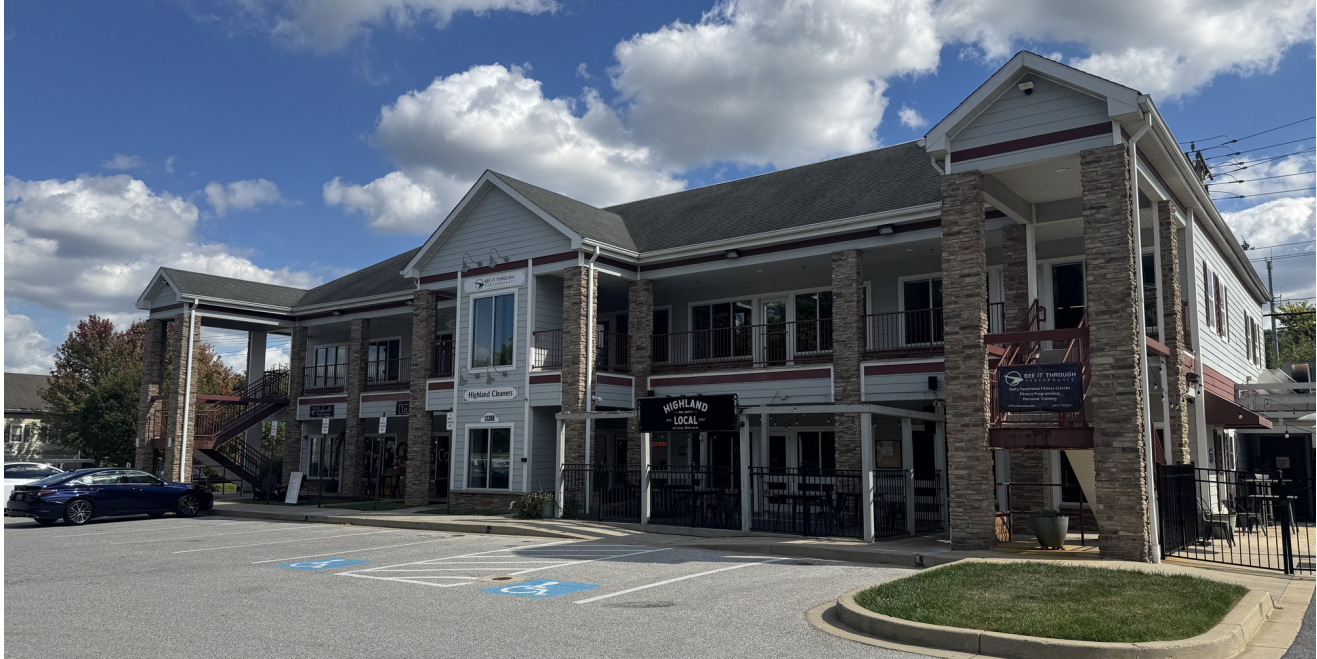
13380 | 2nd Gen Restaurant