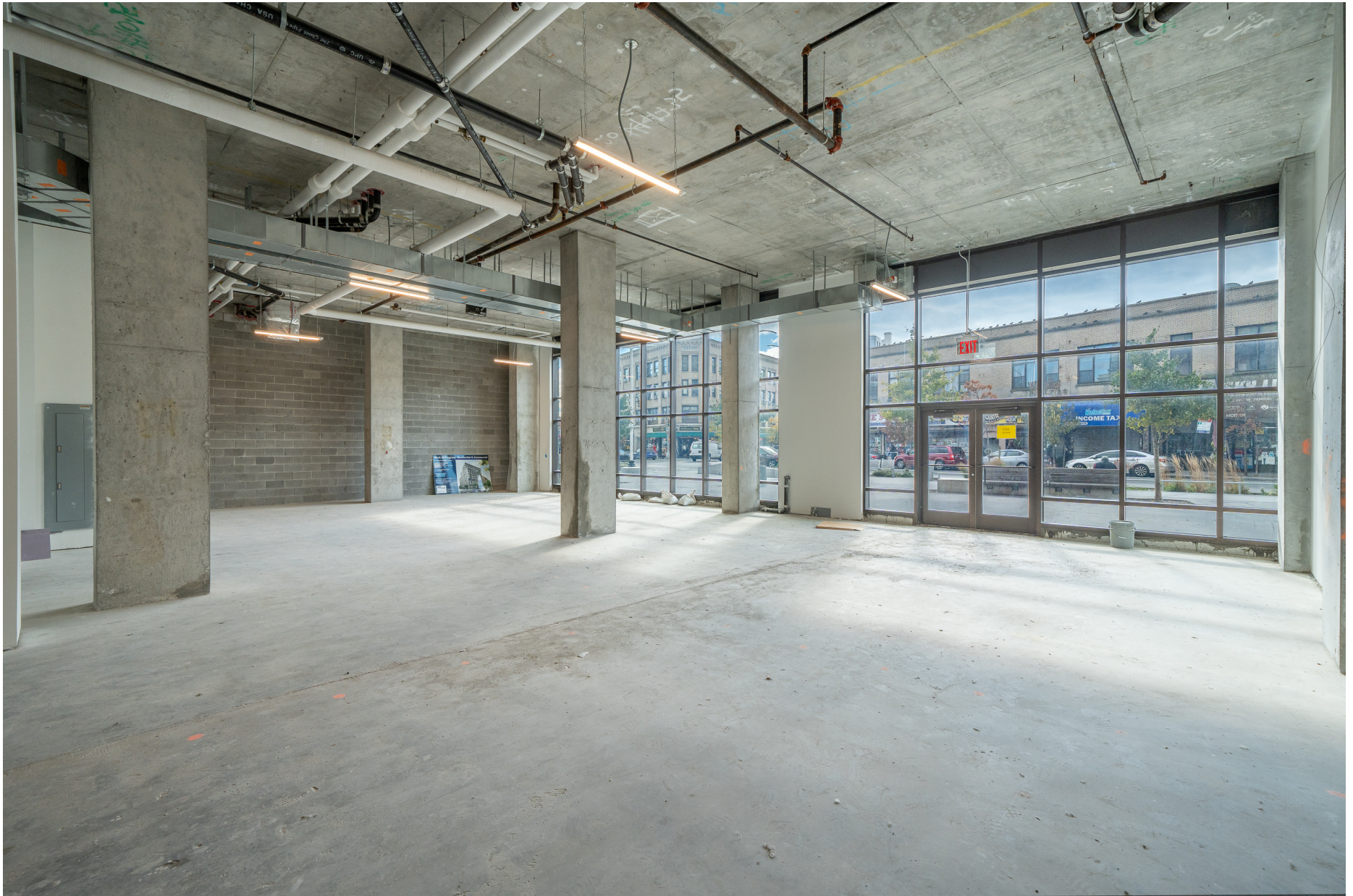
1725 Village Lane-Far Rockaway Stark Plaza-Prime Retail For Lease