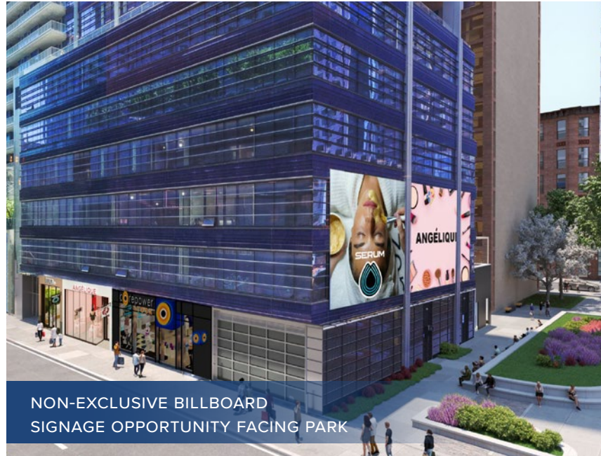
NON-EXCLUSIVE BILLBOARD SIGNAGE OPPORTUNITY FACING PARK