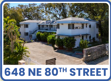
648 NE 80 TH STREET