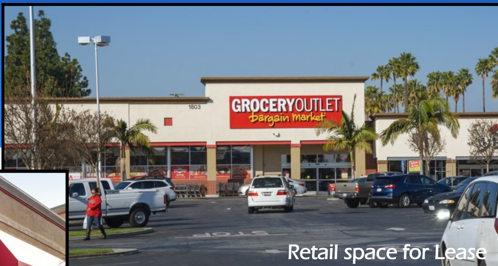
Retail space for Lease