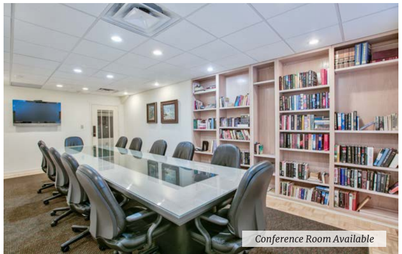
Conference Room Available