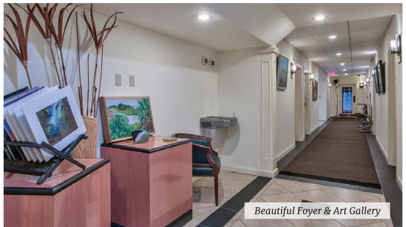
Beautiful Foyer & Art Gallery