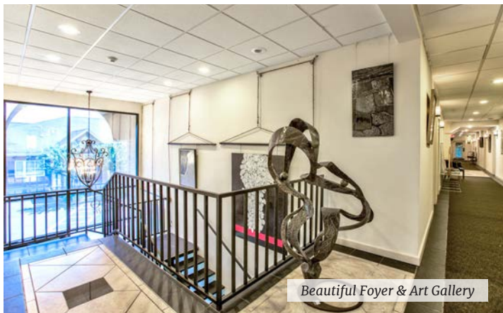
Beautiful Foyer & Art Gallery