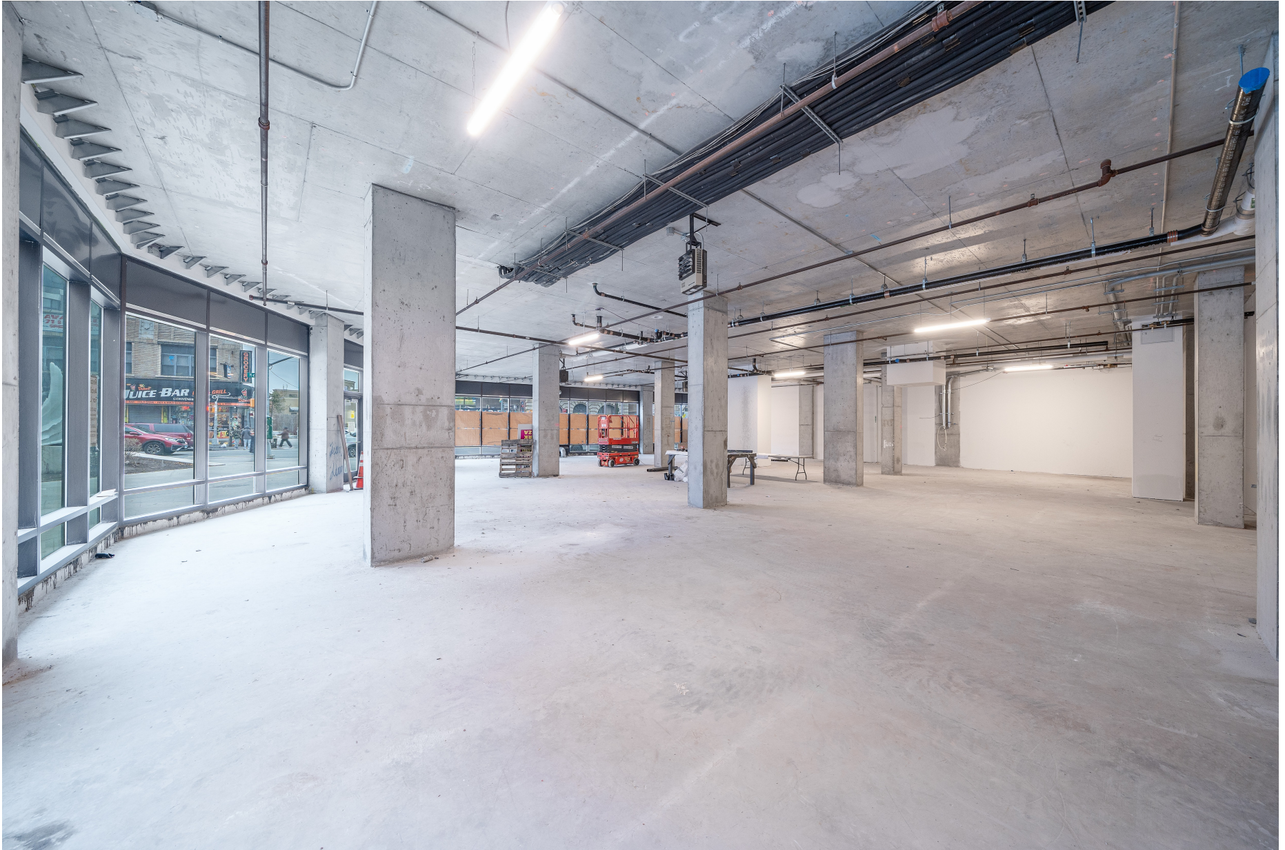
1725 Village Lane-Far Rockaway Stark Plaza Restaurant/Retail For Lease