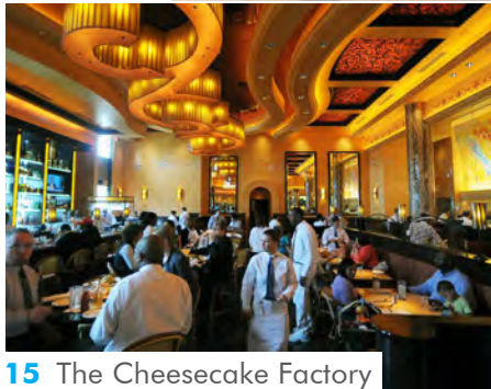
15 The Cheesecake Factory