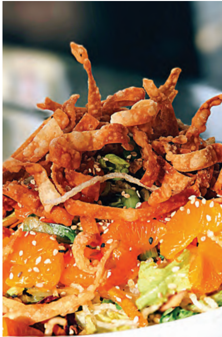
2 The Stand