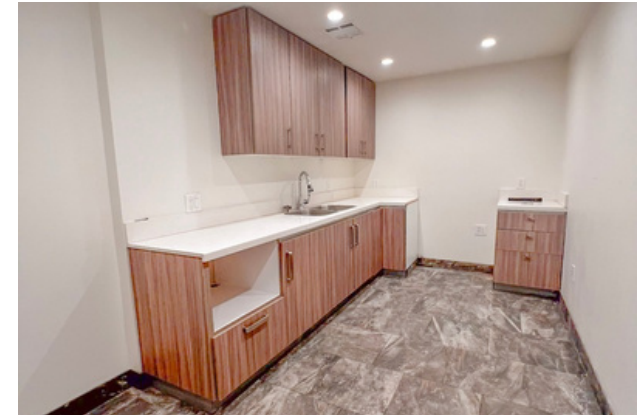
BREAK AREA / KITCHEN