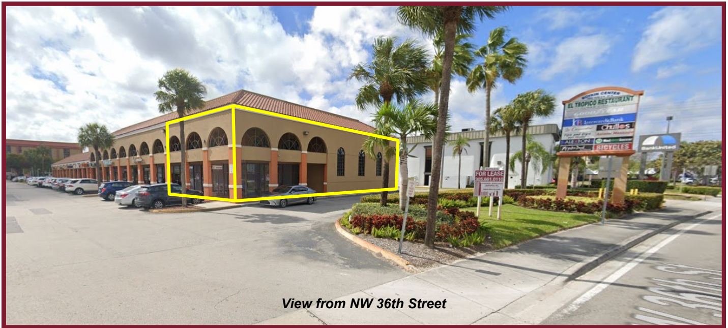
View from NW 36th Street