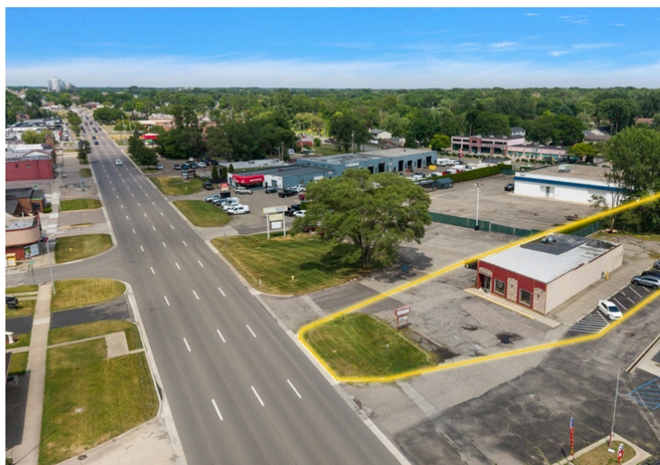
AERIAL VIEW SHOWING GRATIOT FRONTAGE