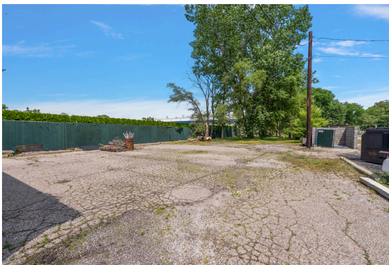
REAR YARD / OUTDOOR AREA