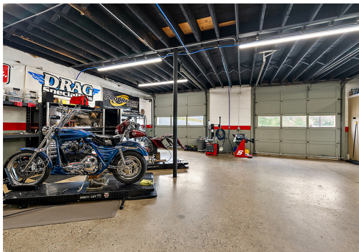
INTERIOR SERVICE BAY / FLEX AREA