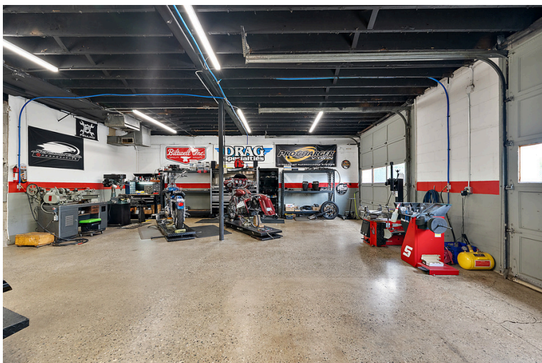
SHOP / WORK AREA WITH OVERHEAD DOOR ACCESS