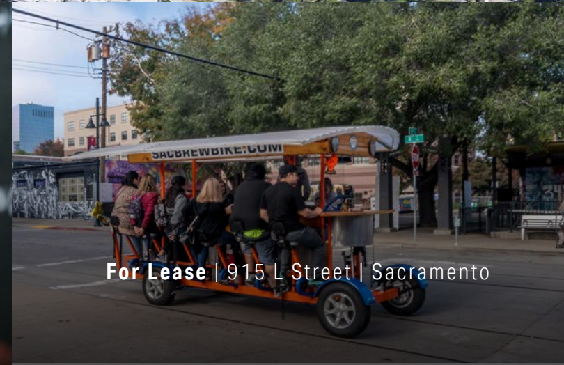
For Lease | 915 L Street | Sacramento