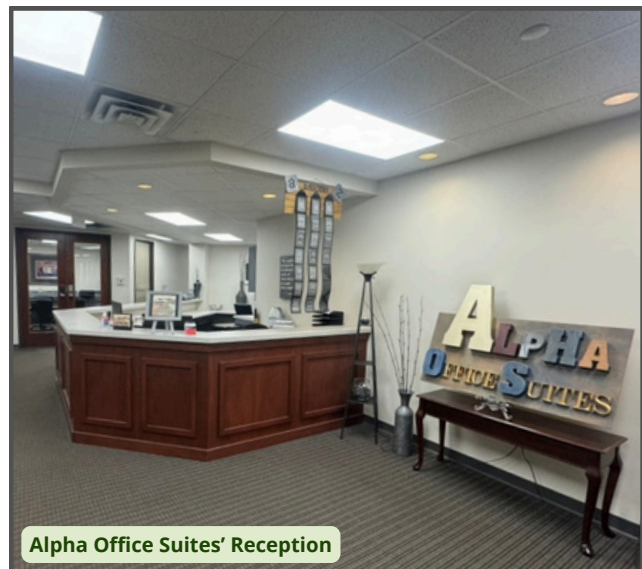
Alpha Office Suites' Reception