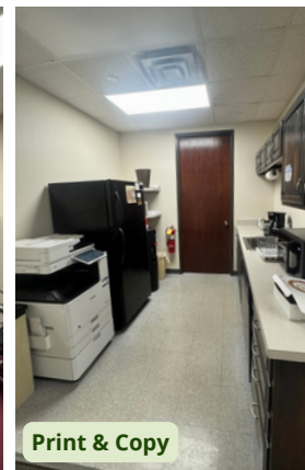
Print & Copy