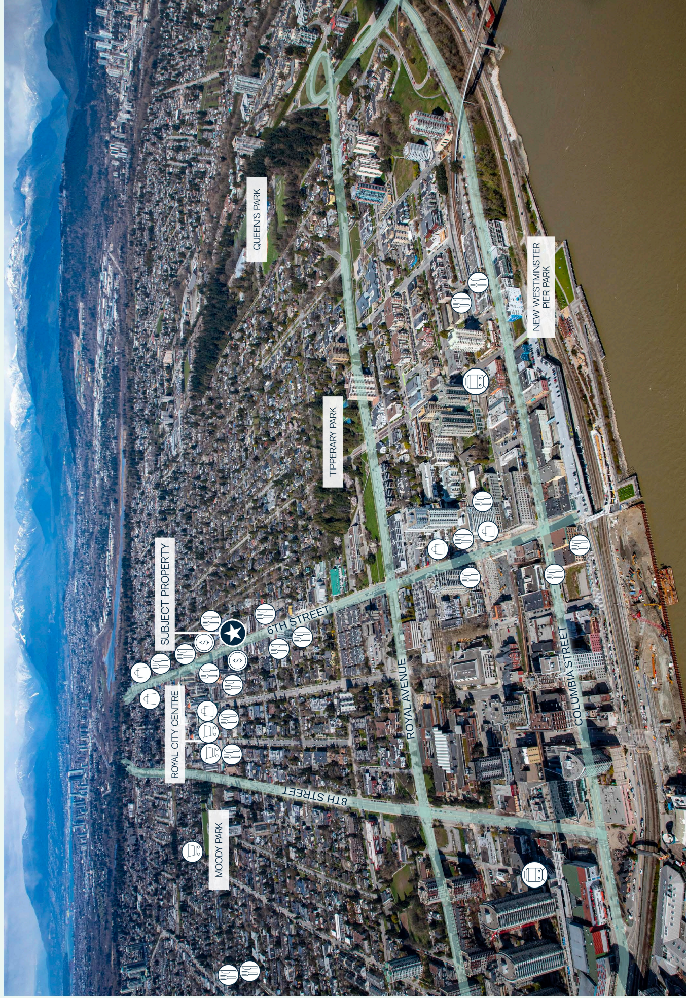
Located in the Uptown neighbourhood of New Westminster, the Subject Property is central to an abundance of shops, restaurants, local amenities, and various transit options.