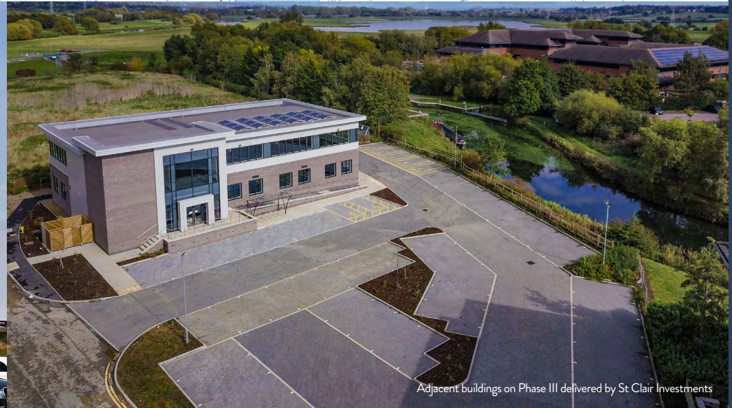
Adjacent buildings on Phase III delivered by St Clair Investments