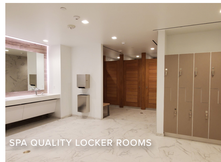
SPA QUALITY LOCKER ROOMS