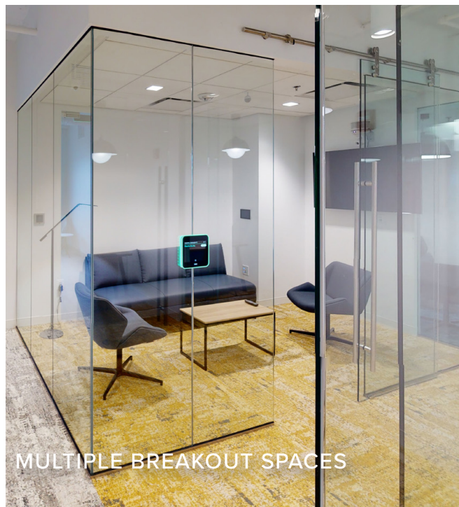
MULTIPLE BREAKOUT SPACES