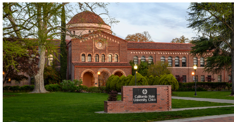
Pictured: CSU Chico, Bidwell Park, Sierra Nevada Brewery