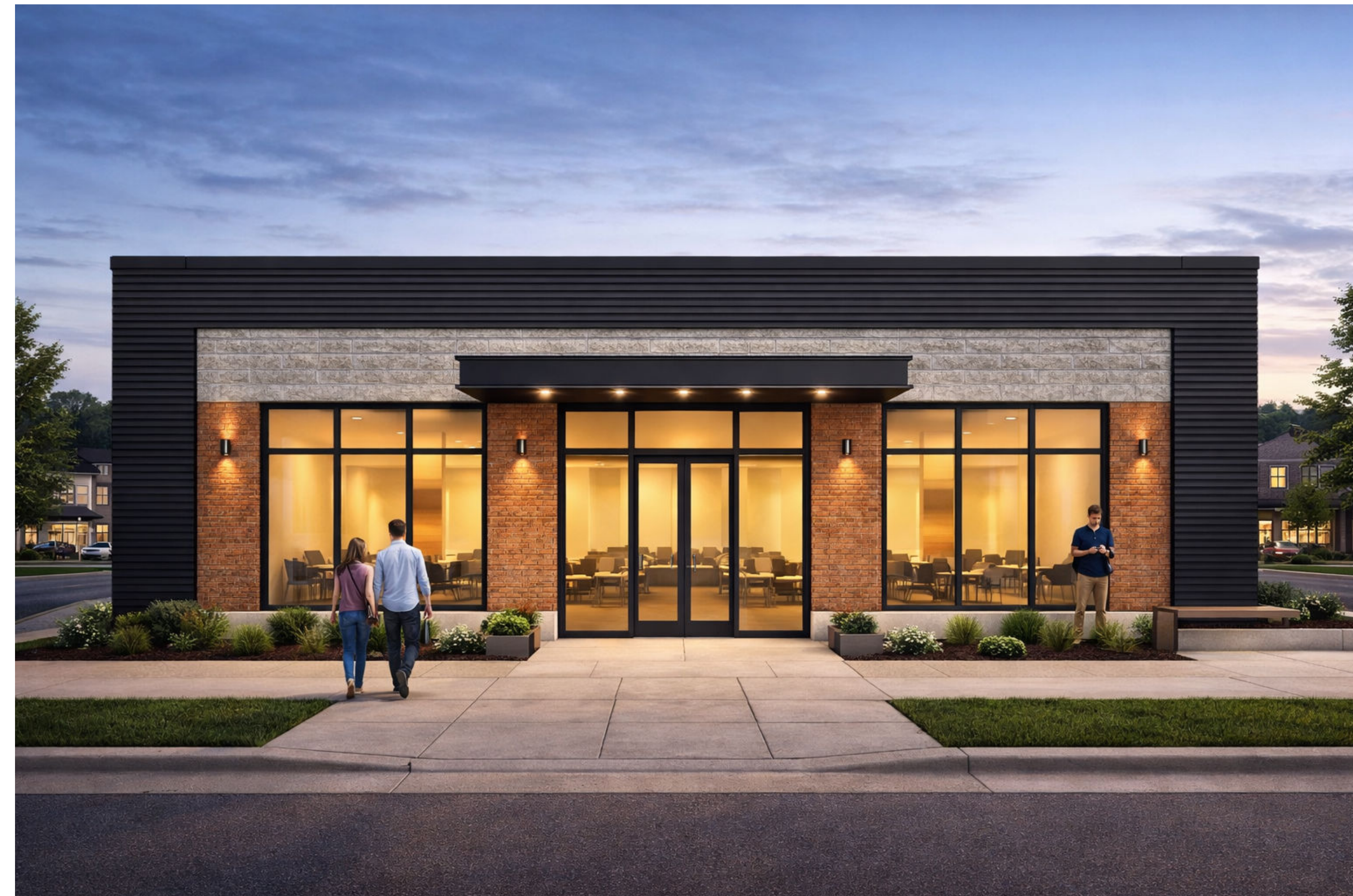
FACADE FRONT RENDER