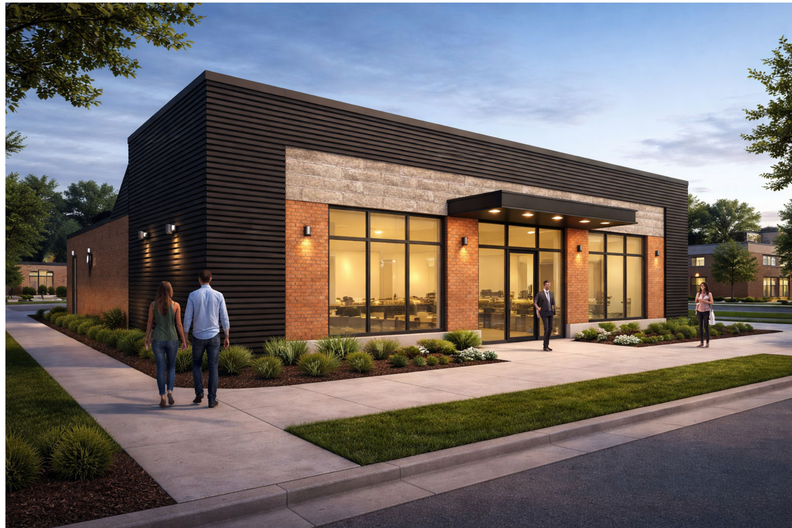
FACADE PERSPECTIVE RENDER