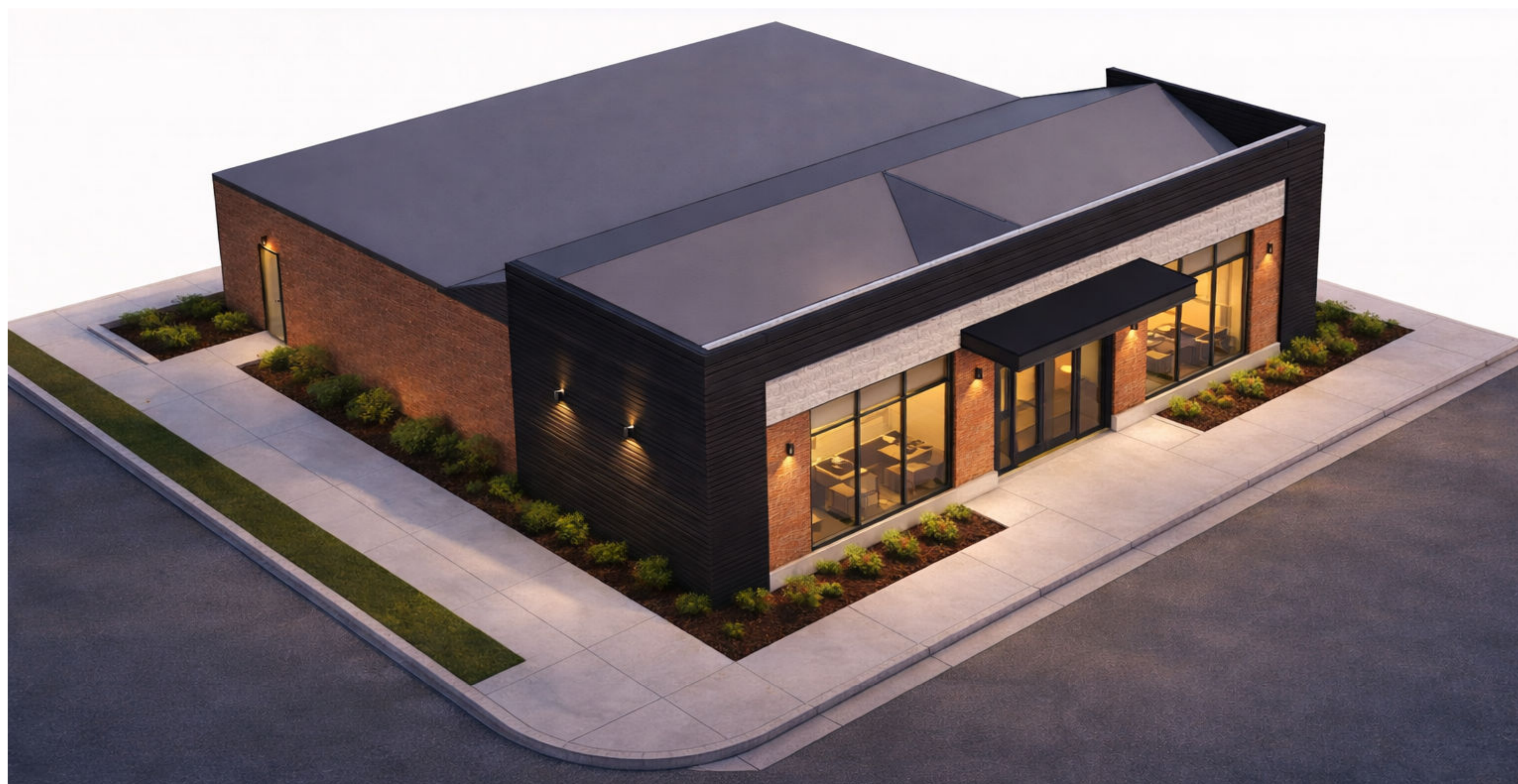
AERIAL PERSPECTIVE VIEW