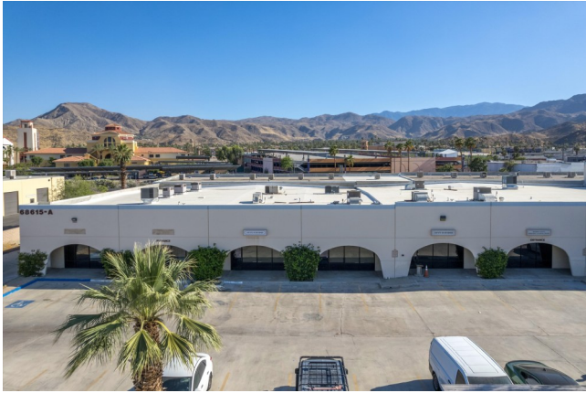
FRONT WITH PARKING FOR UNITS 1-8