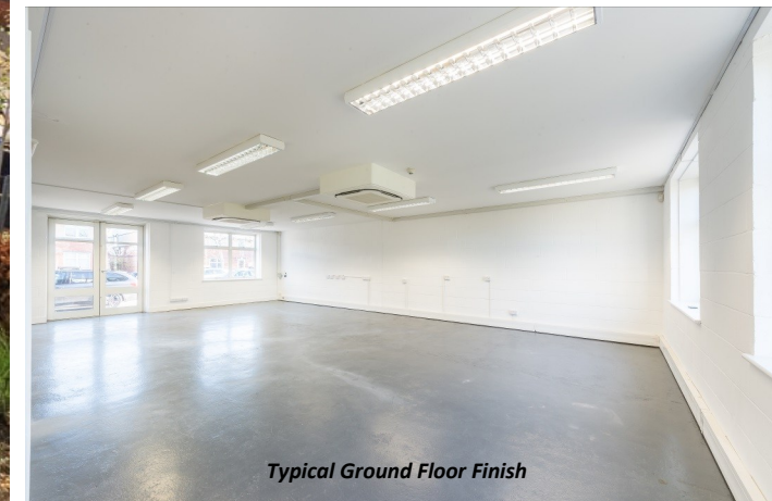
Typical Ground Floor Finish

KINGSMILL BUSINESS PARK, CHAPEL MILL ROAD, KINGSTON UPON THAMES, SURREY KT1 3GZ