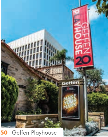
50 Geffen Playhouse