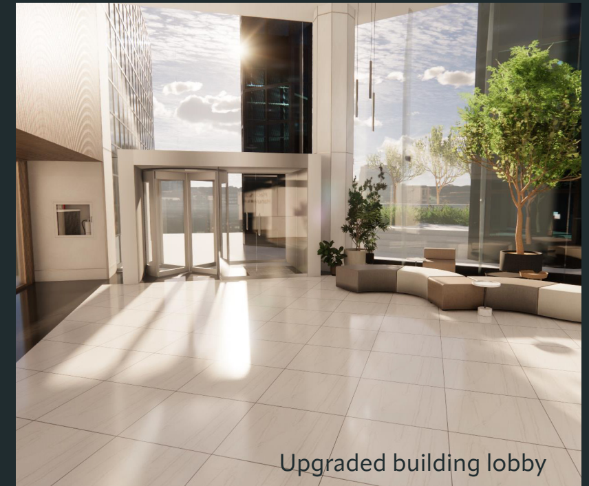
Upgraded building lobby