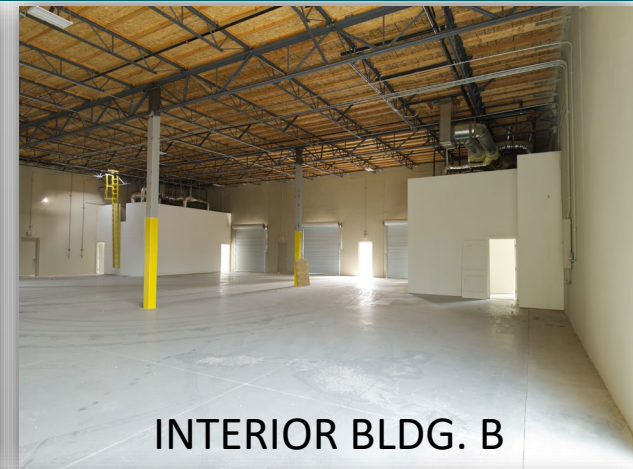
INTERIOR BLDG. B