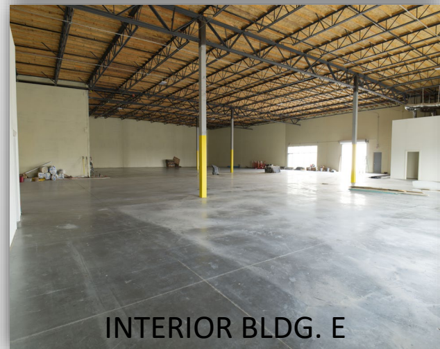
INTERIOR BLDG. E