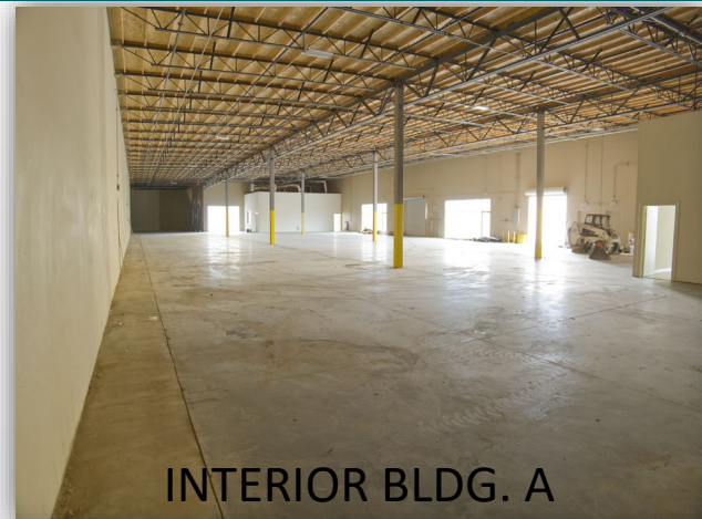
INTERIOR BLDG. A