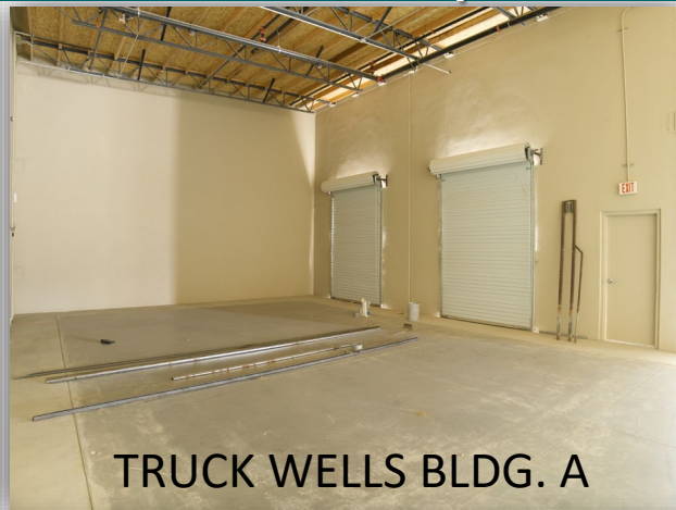
TRUCK WELLS BLDG. A