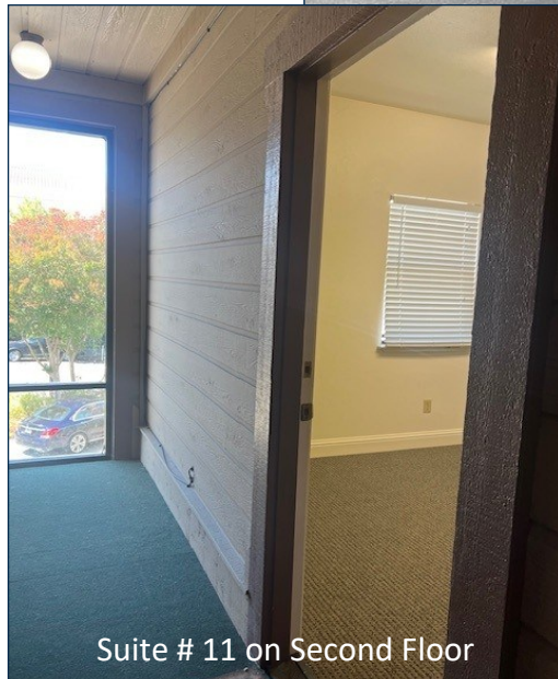
Suite # 11 on Second Floor