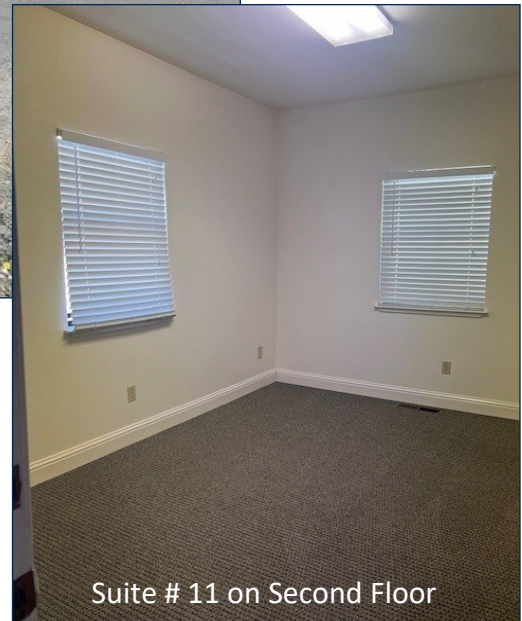
Suite # 11 on Second Floor