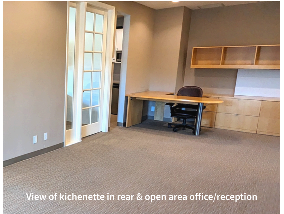
View of kichenette in rear & open area office/reception