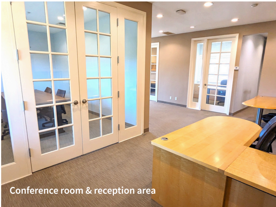
Conference room & reception area