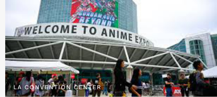
LA CONVENTION CENTER