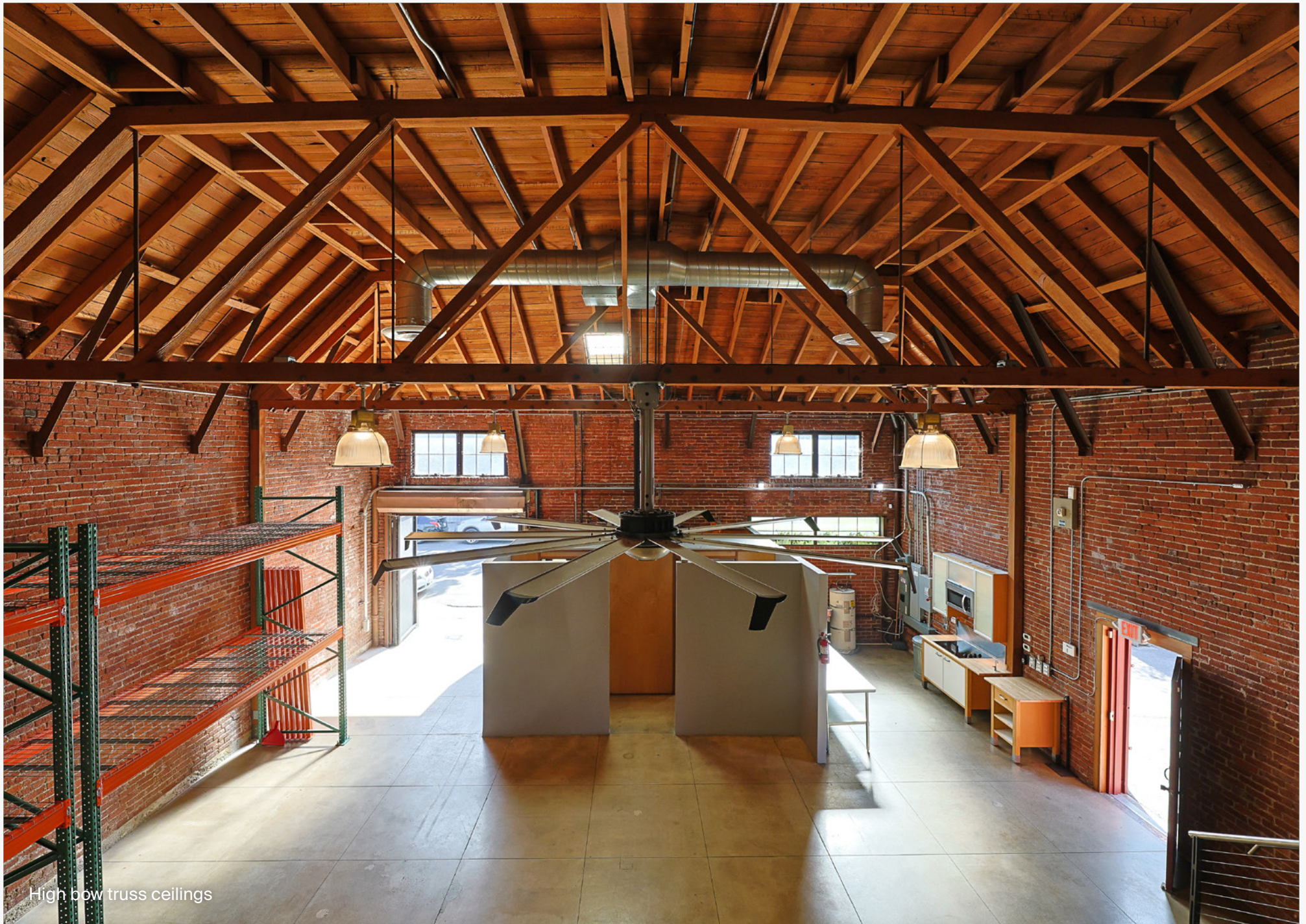
High bow truss ceilings