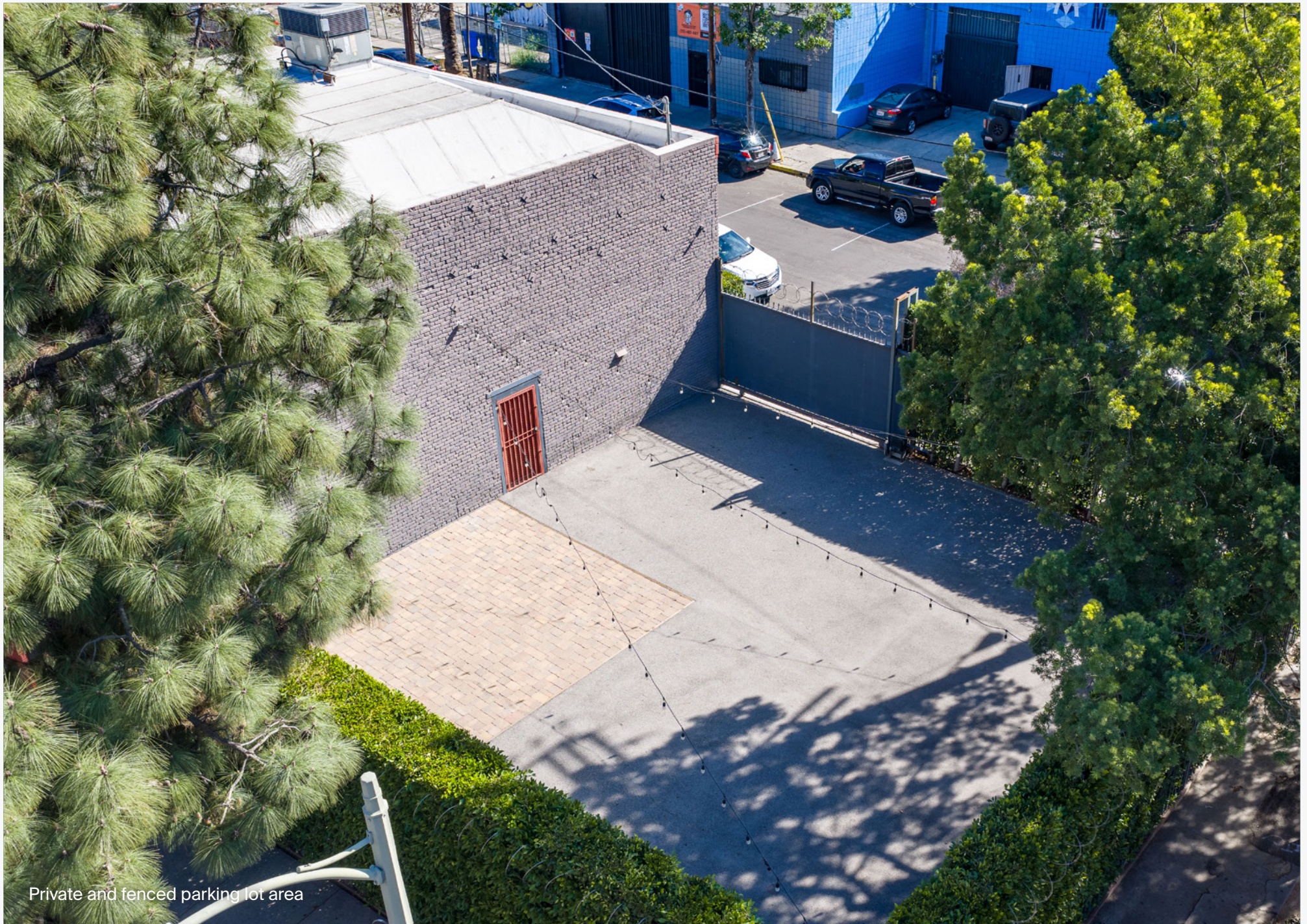
Private and fenced parking lot area