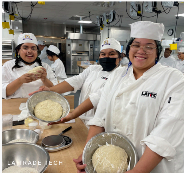
LA TRADE TECH