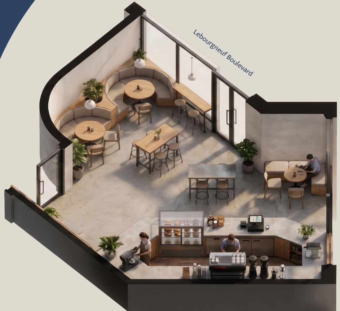
Image for illustrative purposes only. Proposed layout illustrating the potential of the space.