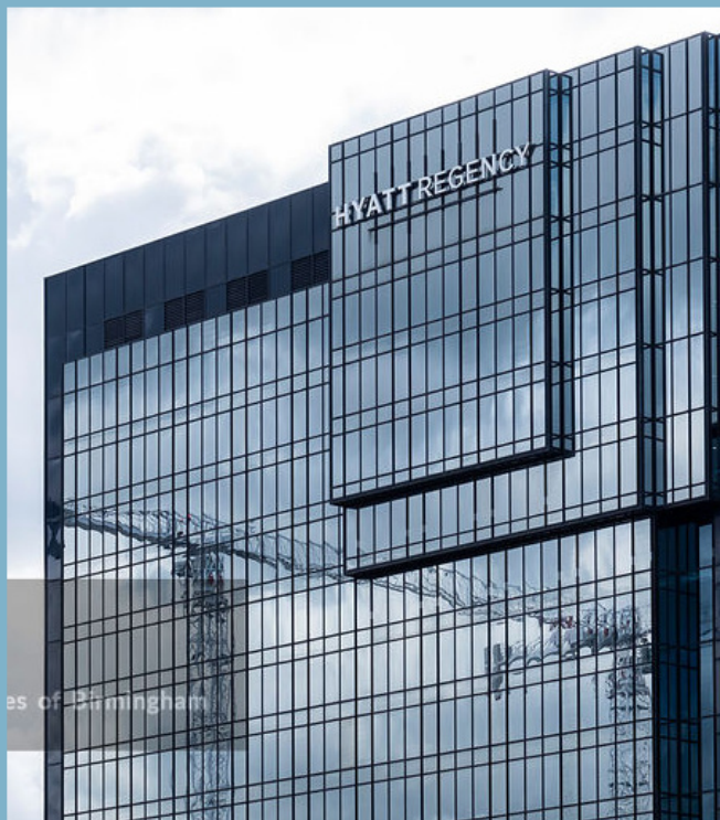
Images of Birmingham