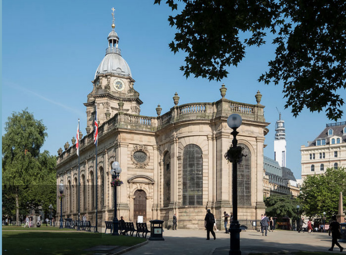
Images of Birmingham