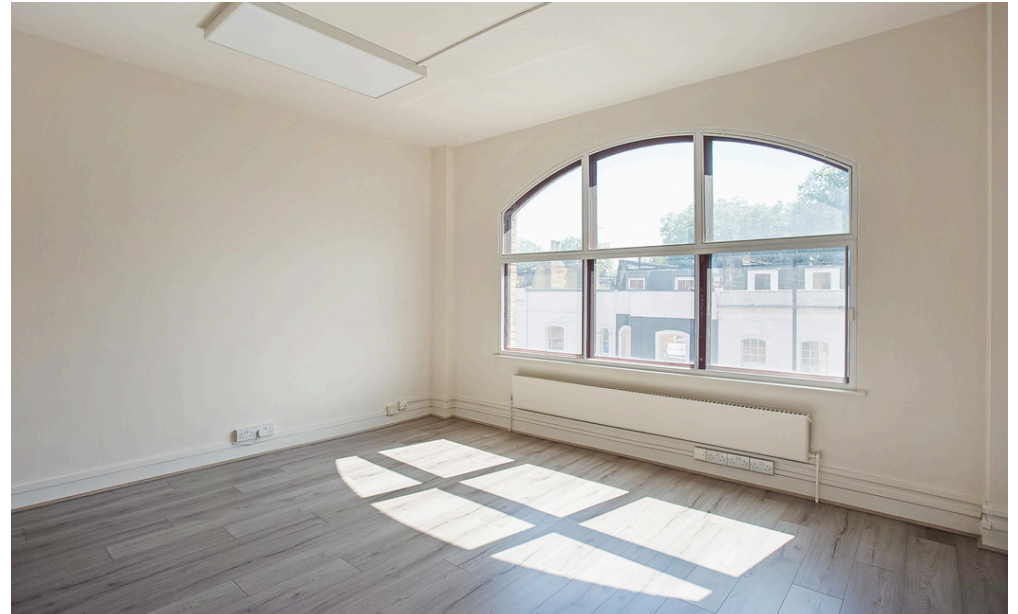
1 ST FLOOR 15 HARWOOD