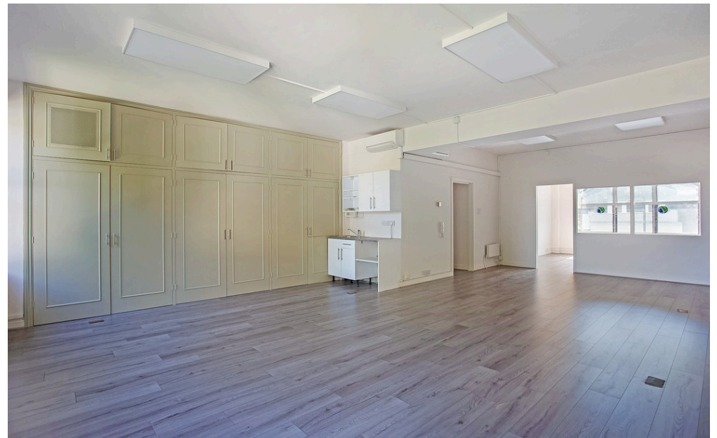
1 ST FLOOR 15 HARWOOD