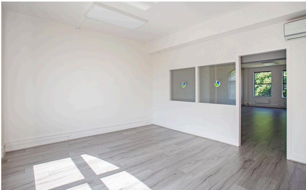
1 ST FLOOR 15 HARWOOD