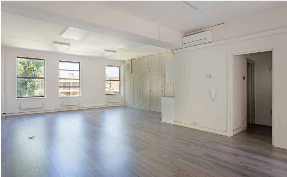
1 ST FLOOR 15 HARWOOD