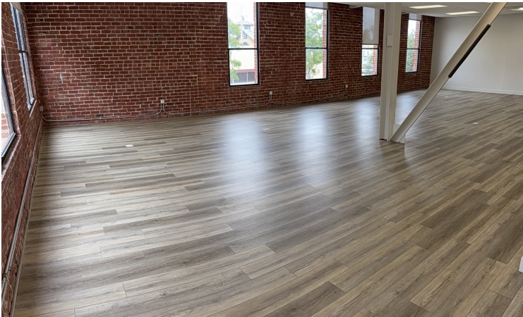
Brick Wall Elevation — Natural Light Windows