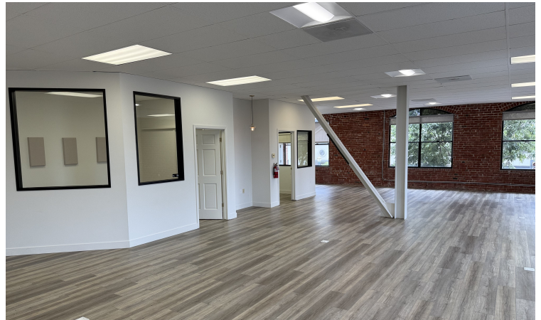
Open Floor Plan — Multiple Configuration Options