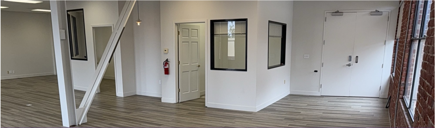
Open Office Area — Exposed Brick Wall and High Ceilings