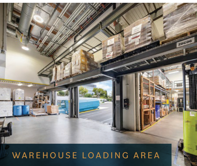
WAREHOUSE LOADING AREA