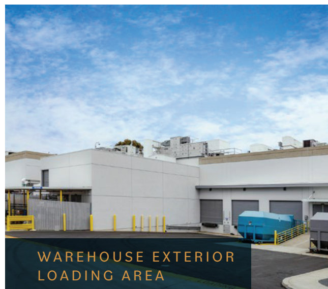
WAREHOUSE EXTERIOR LOADING AREA