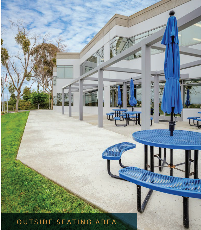
OUTSIDE SEATING AREA