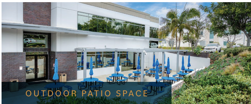
OUTDOOR PATIO SPACE