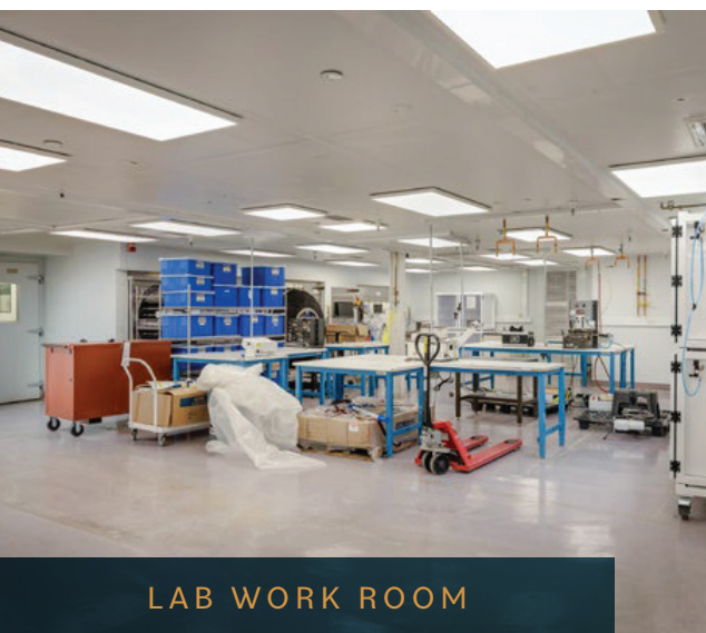
LAB WORK ROOM