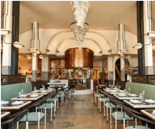
📍 GWEN | 6600 W SUNSET BLVD