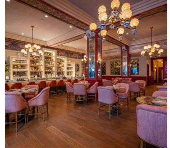
📍 MOTHERWOLF | 1545 WILCOX AVE