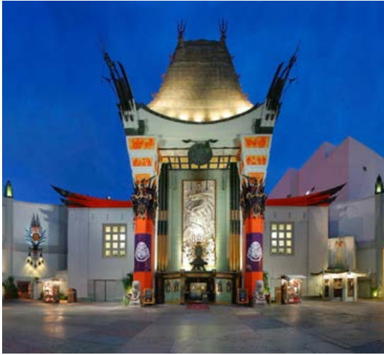
📍 TCL CHINESE THEATRE | 6925 HOLLYWOOD BLVD

WALKING DISTANCE TO SOME OF THE BEST RESTAURANTS AND ENTERTAINMENT IN THE CITY