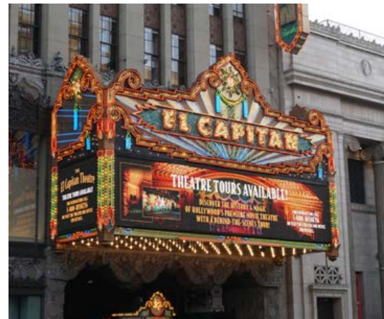
📍 EL CAPITAN THEATRE | 6838 HOLLYWOOD BLVD