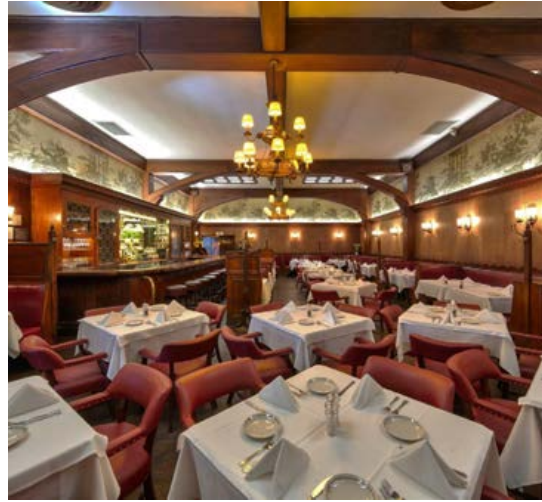
📍 MUSSO & FRANK | 6667 HOLLYWOOD BLVD