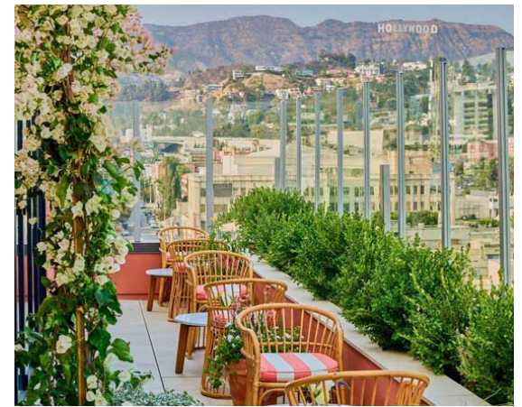
📍 BAR LIS | 1541 WILCOX AVE