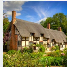
Anne Hathaway's Cottage