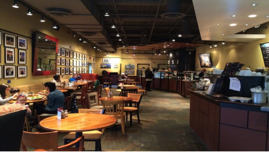
Cosi Coffee @ Main Street in Exton