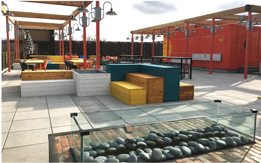
Whole Foods Roof Deck