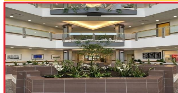
Lobby Featuring Four Story Atrium