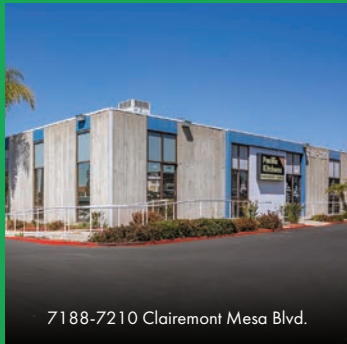
7188-7210 Clairemont Mesa Blvd.