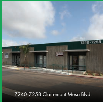
7240-7258 Clairemont Mesa Blvd.