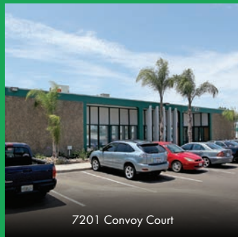
7201 Convoy Court