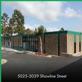
5025-5039 Shawline Street