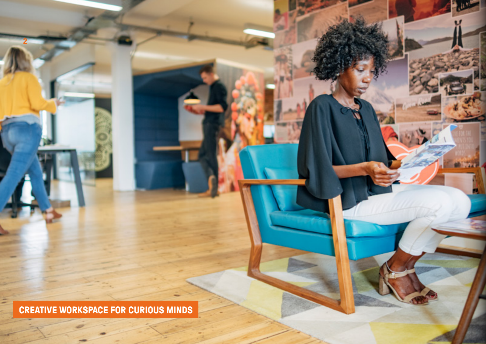
CREATIVE WORKSPACE FOR CURIOUS MINDS