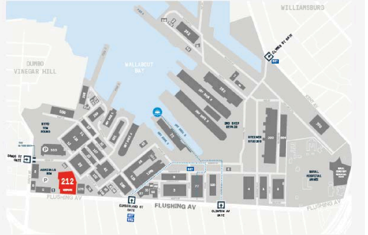
BLDG 212 LOCATION