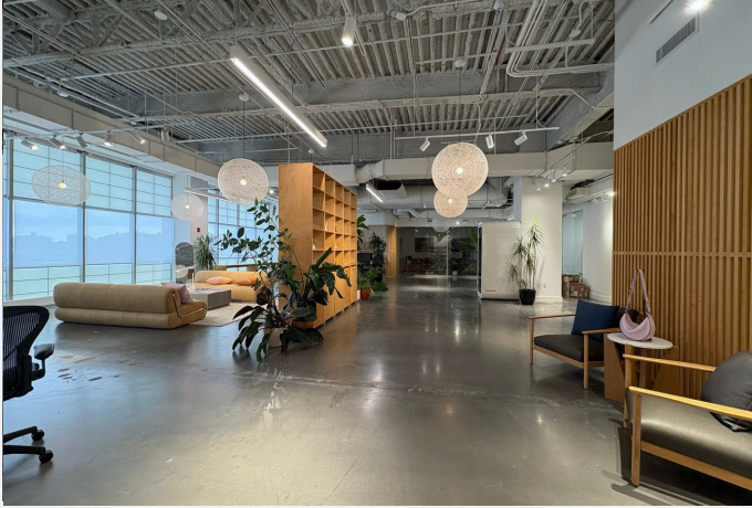
SUITE 507 & 508