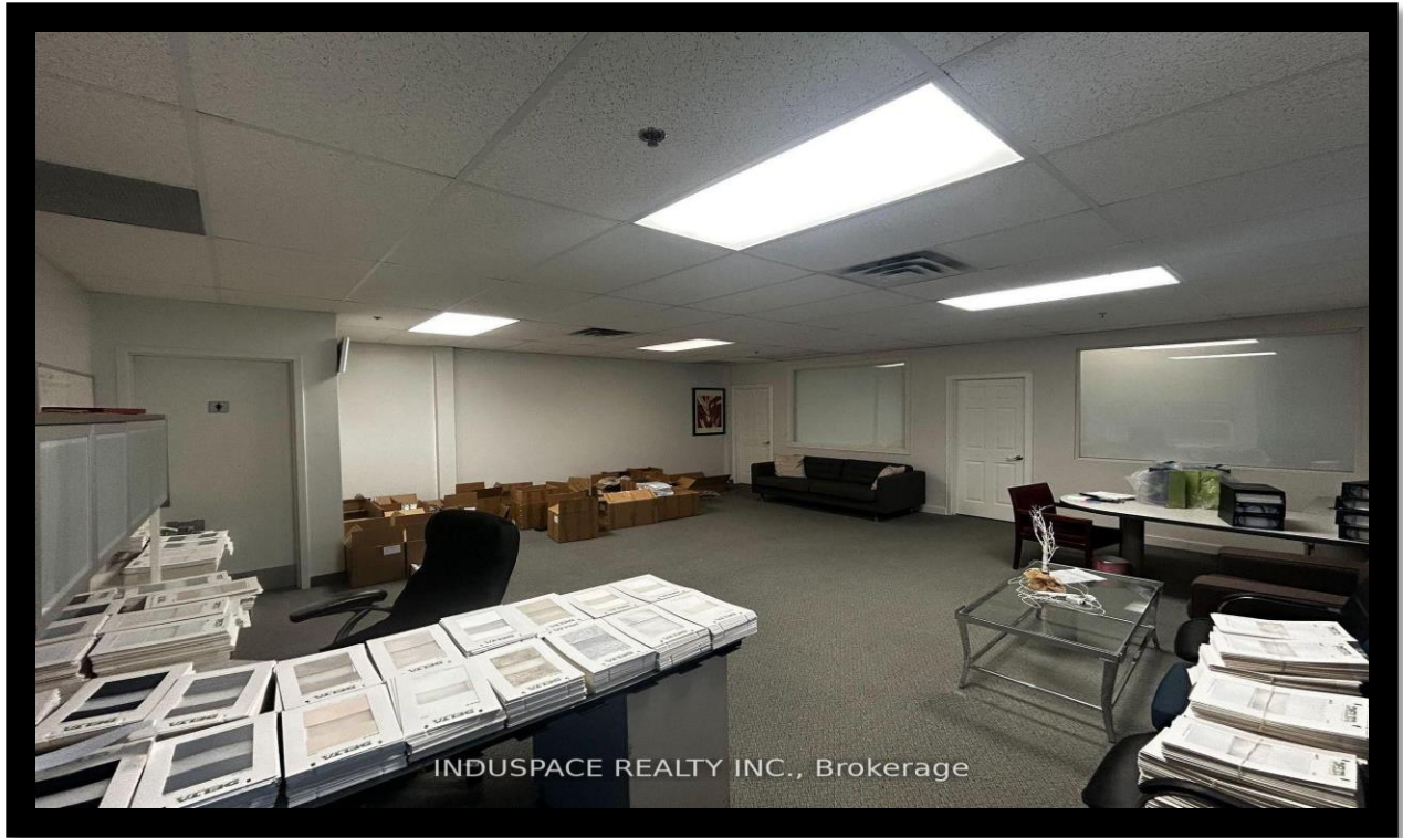
INDUSPACE REALTY INC., Brokerage