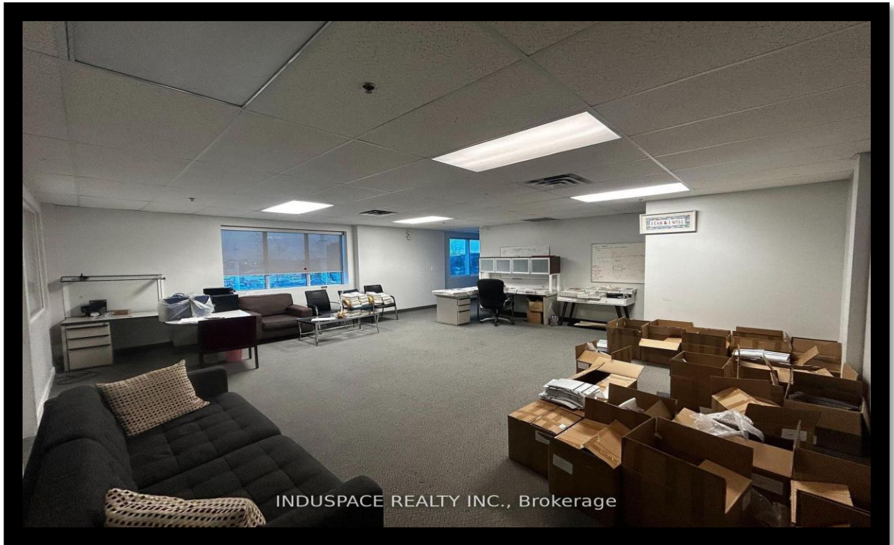
INDUSPACE REALTY INC., Brokerage