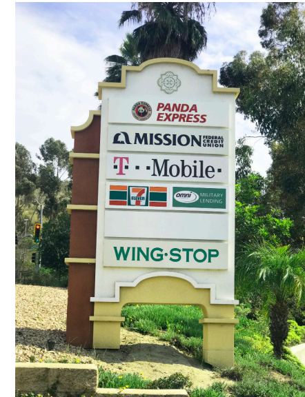
Lighted Pylon Sign

Premium corner suite available along 76 HWY with pylon and monument signage, and dual facade signage on south and east storefronts!