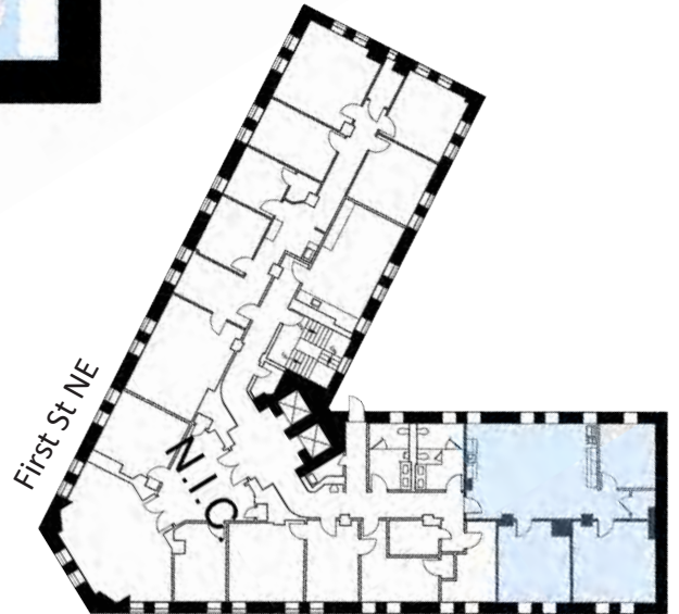
Maryland Avenue NE