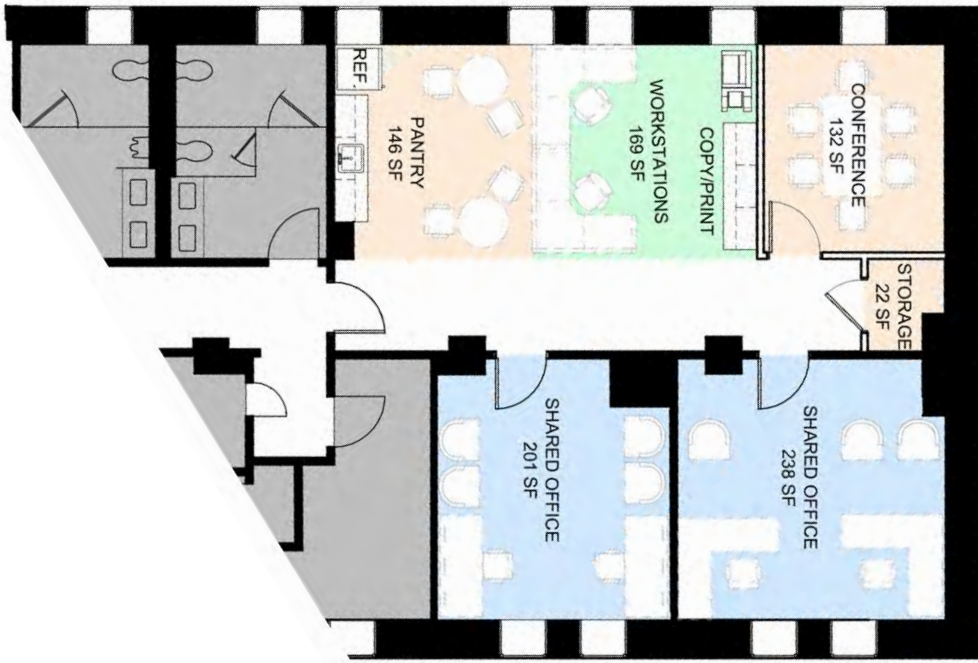
Maryland Avenue NE